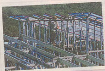
Steel-frame designs come in kit form

For more details visit the company's factory at 24 Mercantile Court, Molendinar, go to www.steelhomes.com.au or call 5547 7496.