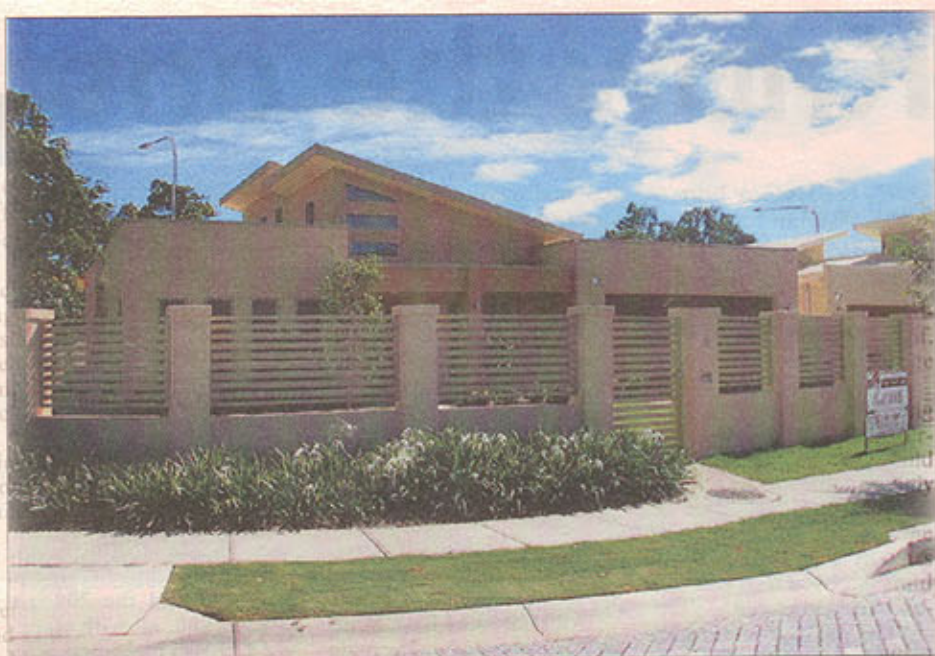
Steel frames give homeowners plenty of options in design and building