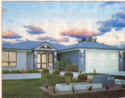
• Artist's impression