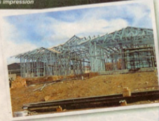
Kit-home packages are a new direction for this builder

For details call 5574 4796 or go to www.steelhomes.com.au